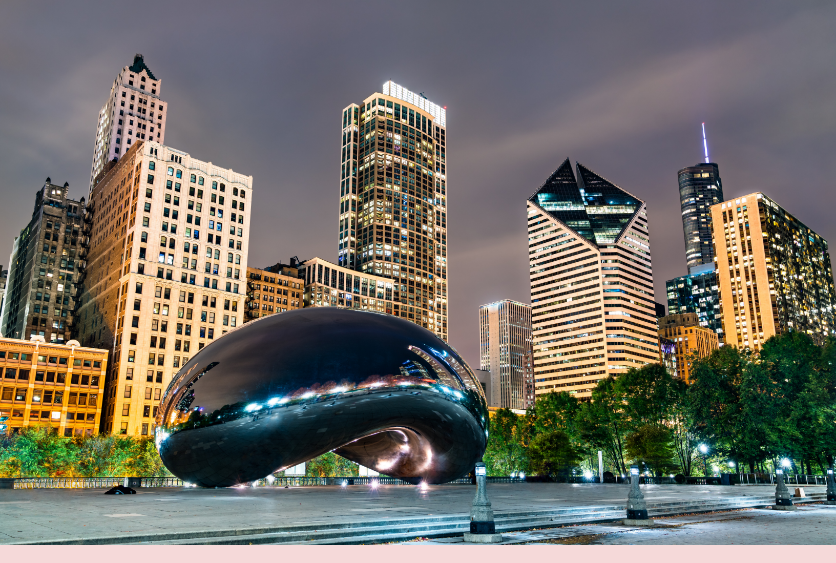
Join us in Chicago for the 2024 International Perinatal Bereavement Conference